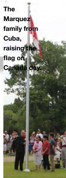
The Marquez family from Cuba, raising the flag on Canada day.