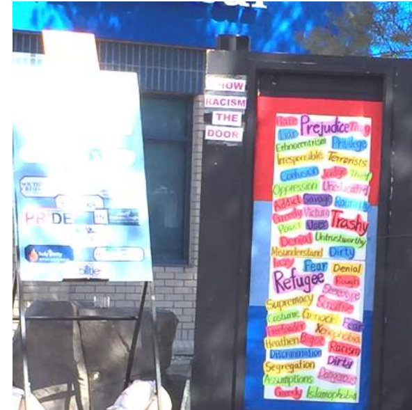
Shut the Door on Racism- March 21, 2017. Our partner organizations celebrated w/ us.