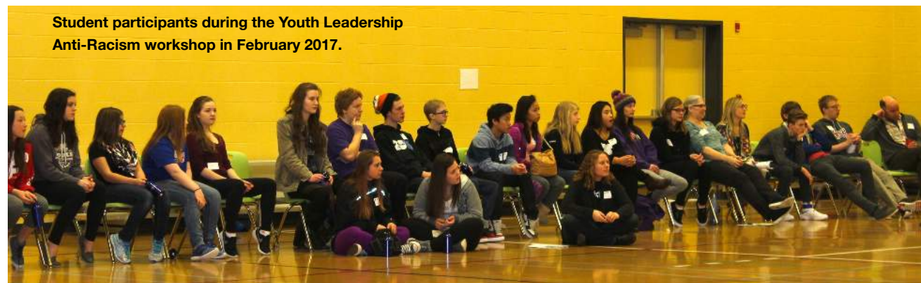
Student participants during the Youth Leadership Anti-Racism workshop in February 2017.