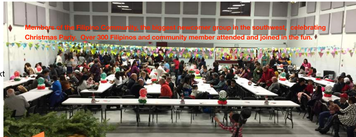
Members of the Filipino Community, the biggest newcomer group in the southwest, celebrating Christmas Party. Over 300 Filipinos and community member attended and joined in the fun.