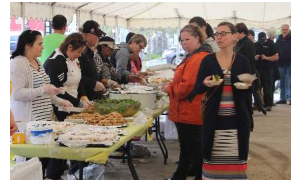
Our Lunch fund-raiser held last May 31, 2016. We raised over $2000.

Over 2000 volunteer hours were received over the period from our generous volunteers .