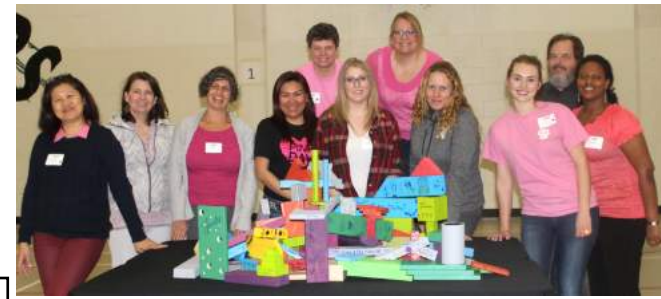
Facilitators for the Anti-Racism Workshop held in Ponteix School, March 2016.

email: nwc@newcomerwelcomecentre.com Tel. #: (306) 7786262 Fax #: (306) 7786226