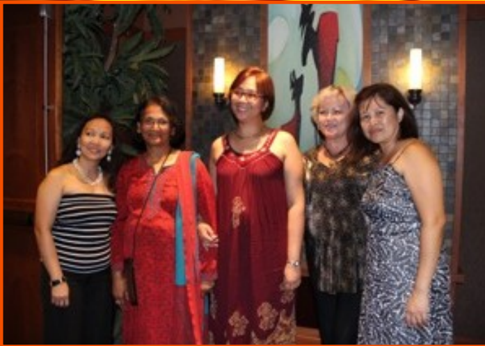
The event was presented and organized by the Southwest Multicultural Association