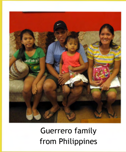
Guerrero family from Philippines